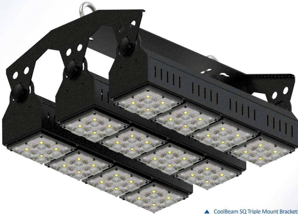
▲ CoolBeam SQ Triple Mount Brackets

Easy combination of multiple engines into a luminaire lead to endless lumen applications. The building block on itself is a proven concept, both from lighting as from a thermal point of view. Here below an example of a 48.000 lumen stadium light containing 12 pieces of 2x2MX blocks.