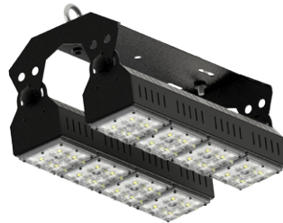
CoolBeam® SQ Dual mount bracket