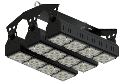
CoolBeam® SQ Triple mount bracket

▲ CoolBeam® kits series for MechaTronix 2x2MX LED Coolers as above.